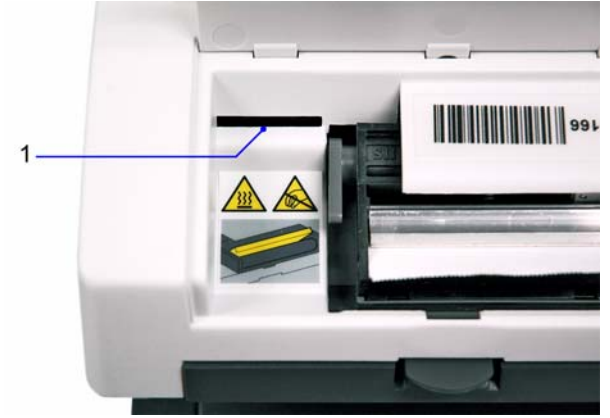
Figure 7-1: Memory Card Slot

3. Insert the memory card (label side up, arrow facing the slot) into the memory card slot to the left of the printer mechanism, until the card stops and then clicks (see Figure 7-1 ).