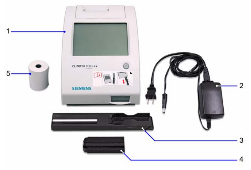
Figure 1-1: Clinitek Status+ Analyzer Components

• Depending on the analyzer model you received, you also could have a Warranty Registration Card, Unpack and Installation Guide, and Quick Reference Card.