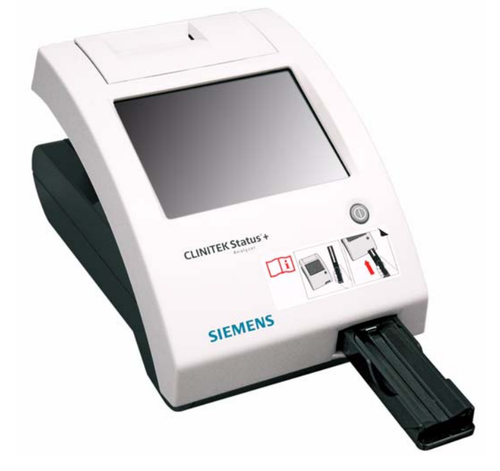
Figure 1-3: The Test Table and Test Table Insert

Note The test table insert adapts for use with a Siemens urinalysis strip or an hCG cassette. Use one side for a strip test and the other side for a cassette test.