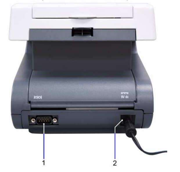
Figure 1-2: Assembling the Clinitek Status+ Analyzer

2. Connect the appropriate end of the power cord into the power inlet socket located on the back of the analyzer (see Figure 1-2 ).