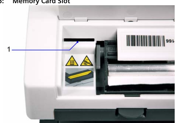
Figure 1-6: Memory Card Slot

You can update the software by inserting a memory card into the slot under the printer cover (see Figure 1-6 ).