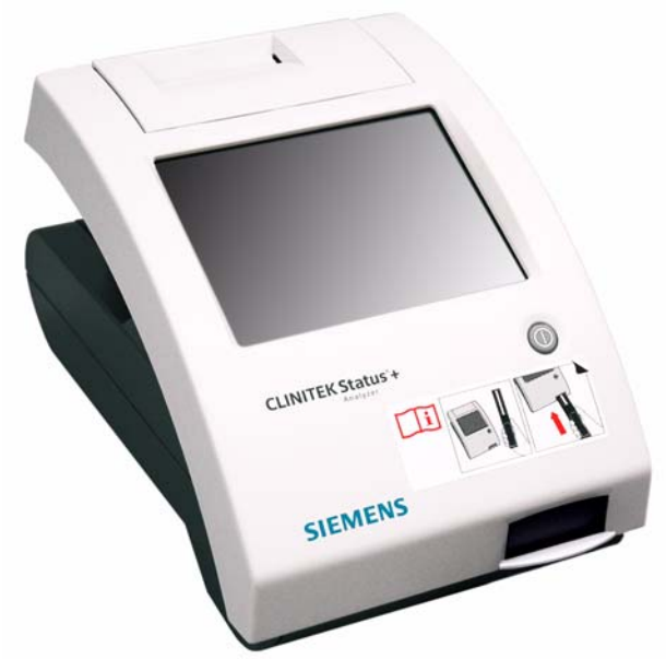
Figure 1-5: Touch Screen Display

Note If you run a CLINITEK Status+ analyzer with a CLINITEK Status connector, you can use a handheld bar-code reader to enter information into the analyzer.