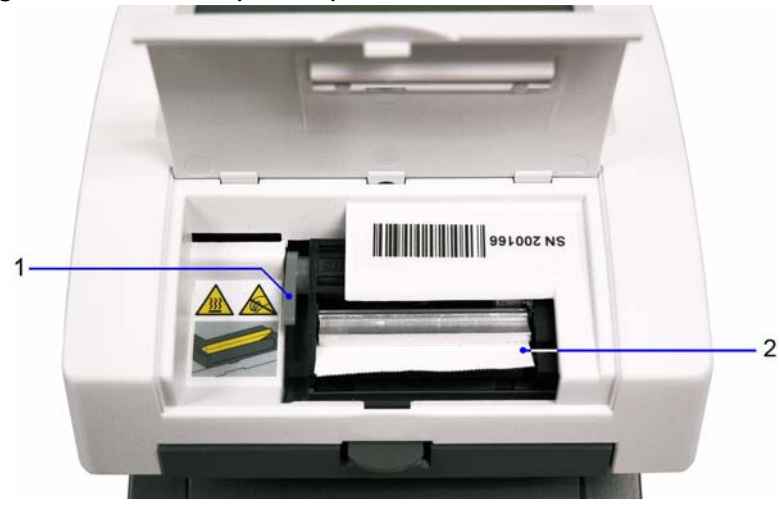
Figure 1-4: Printer Paper Compartment

Note By default, the analyzer automatically prints the test results. To disable the automatic print function, see Section 7, System Configuration, Changing the System Settings , page 105.