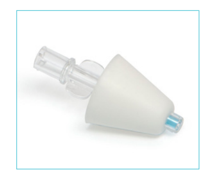
Airway Management • Pulmodyne®